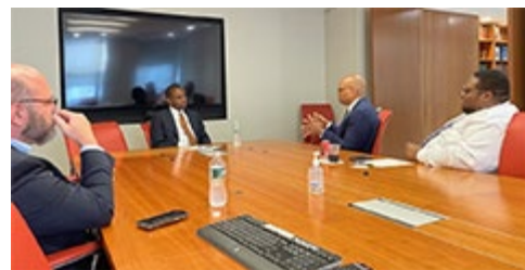
Photo Caption: The NYSSCPA Government Relations Team meets with the New York State Lieutenant Governor Antonio Delgado

Meeting with the Lieutenant Governor: Members of the NYSSCPA Government Relations Team met with Lt. Gov. Antonio Delgado at our Manhattan headquarters. During this conversation, our team introduced the lieutenant governor to our Legislative Agenda while also speaking with Delgado about where the Society can lend a helping hand.